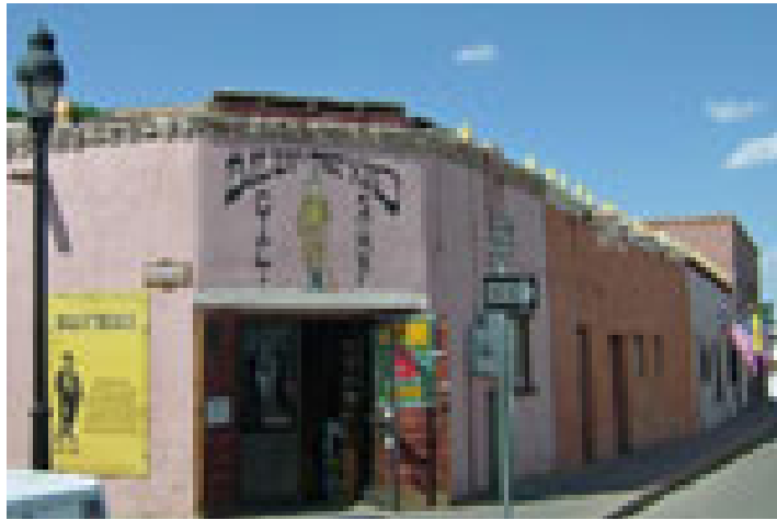
Figure 1. Historic Old Mesilla Plaza has over 40 shops with traditional and contemporary arts and crafts from the southwest, Mexico, and Central America. Mesilla is a part of living history. Great care has been given to preserve the original adobe buildings and the beautiful plaza. People from all over the world stop to experience the history, art, architecture, and quaint shopping that Mesilla has to offer.

Directions to Historic Old Mesilla Plaza from the Ramada Palms: