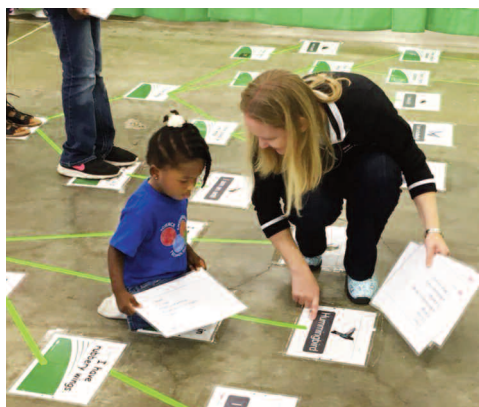
Example of Map Key

Arrange Pollinator Key Cards in order shown. Affix securely with packing tape or stakes using painters or lab tape to create the connected lines. Note: The order must be followed, but the shape of the Map Key can be altered to suit space.